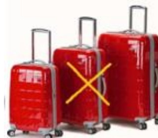
HARD SIDED BAGS NOT PERMITTED