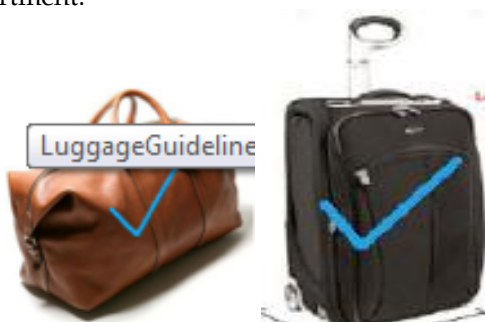
SOFT SIDED BAGS PERMITTED